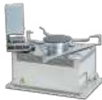
Passive-grip Prealigner PPS1130