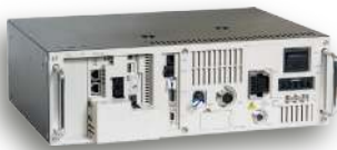
Robot Controller SR200